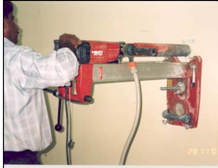
Extracting Core from Retaining Wall