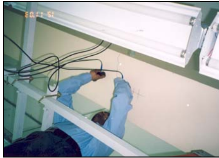
Ultrasonic Pulse Velocity Test on Beams