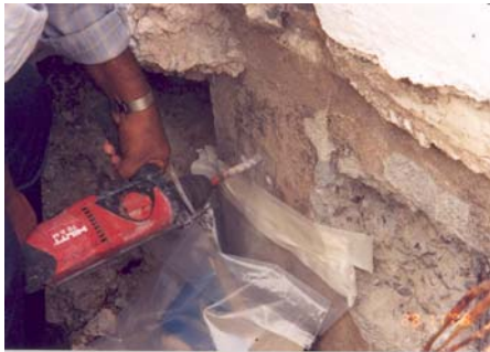
Extracting Dust Samples for Chemical Tests